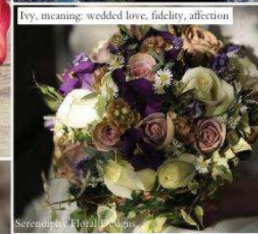
Serendipity Floral Designs