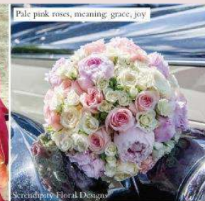
Serendipity Floral Designs