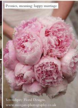
Serendipity Floral Designs